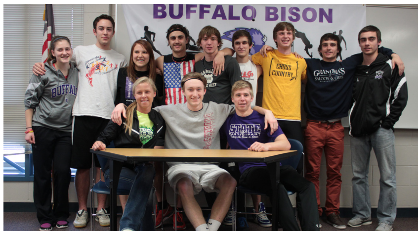
These Bison track athletes are going to college and will continue to participate in track in their new environment.

"I think it's hurting us because tge courts inside suck to play on in comparison to playing outside."