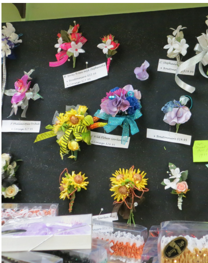
The corsage board makes decisions easy.

"Prom season always comes to an end," said Speckel, "But I hope the legacy of prom flowers never ends." The students at Buffalo High School support the tradition and hope to keep it going.