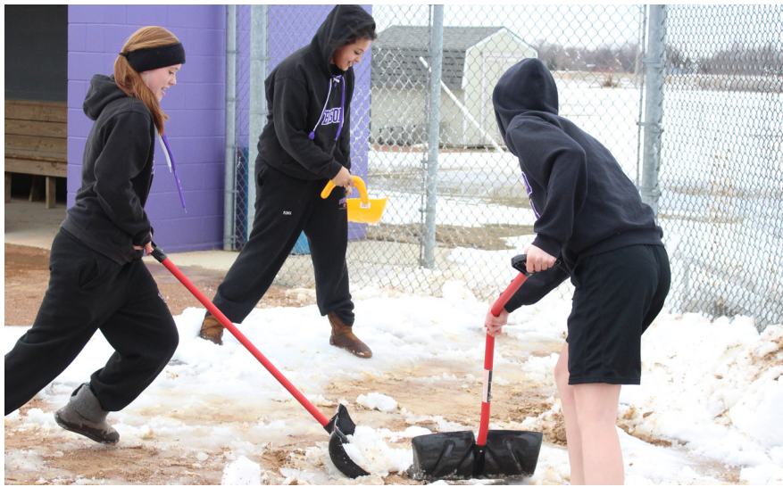
The Bison Softball team keeps their rakes in the shed and brought out the shovels to try to find their snow covered dirt this year.

Although Minnesota weather may be unpredictable, the athletes of Buffalo High School know how to get down to business when times are tough.