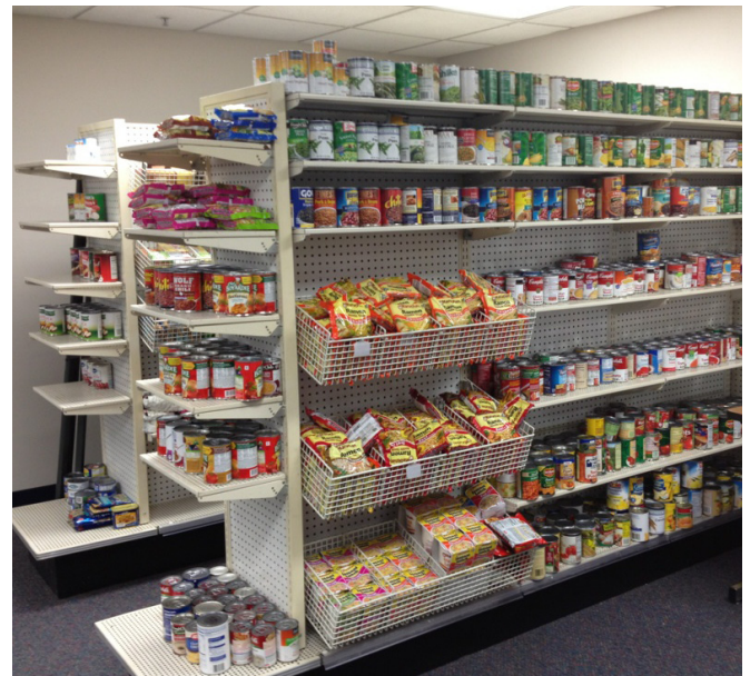
The growing food shelf at the Wright County courthouse supplies food for the "Backpack Buddies" program.