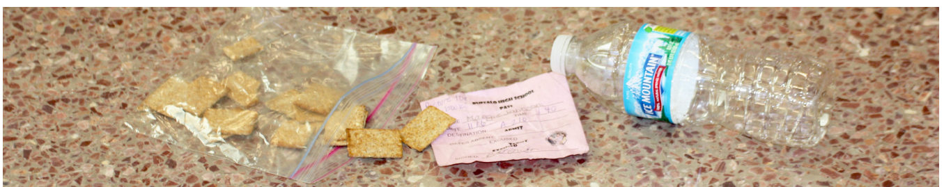
The right for students to eat, drink, and leave the room freely in class varies from teacher to teacher.

Grades should represent performance in a subject, not non-academic factors such as bathroom use, participation, or a student's ability to sit for 80 minutes. Increased trust between teachers and students would prevent students from abusing their rights which will lead to more positive experiences for both students and teachers.