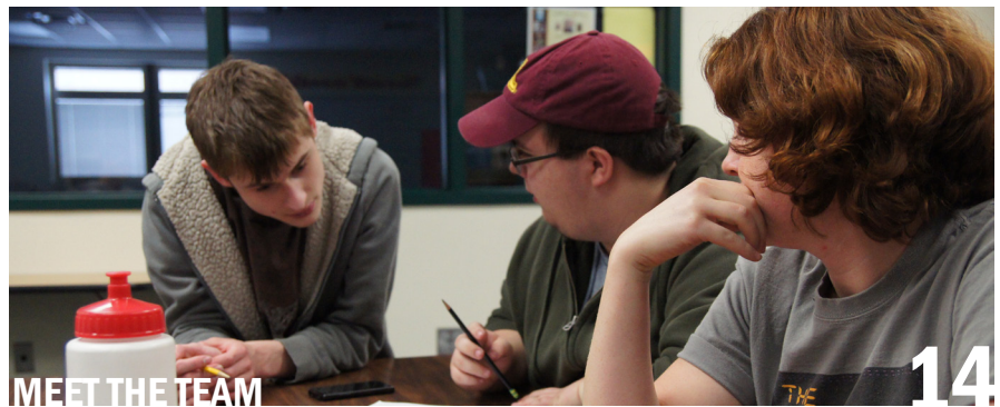
MEET THE TEAM