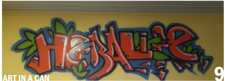
ART IN A CAN