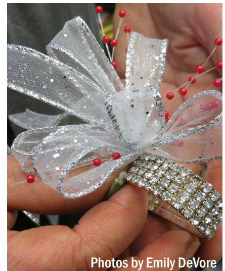
The start of a beautiful wedding corsage.