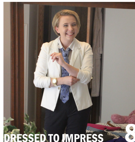
DRESSED TO IMPRESS