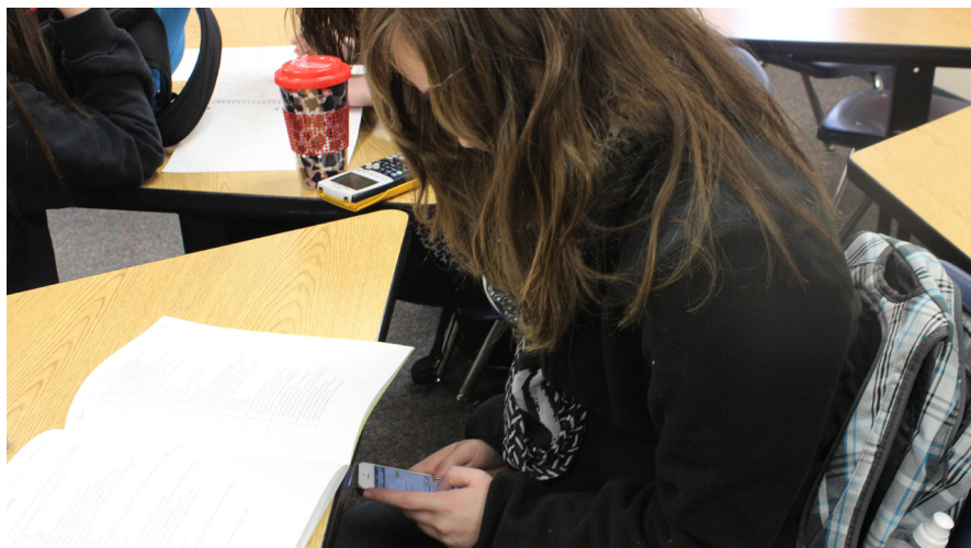
Students hide try to hide their cell phones while texting friends and family members in class.